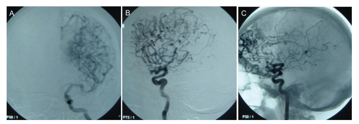
Figure 2 : Cerebral angiography showing (A – left internal carotid artery / frontal view; B - left internal carotid artery / lateral view; C - right internal carotid artery / lateral view without subtraction) a diffuse network of vascular structures throughout the left frontal lobe, with multiple feeders, without a dominant one.

When hemorrhage is the target, partial embolization seems to be sufficient. Partial targeted embolization was employed and yielded progressive improvement in the case reported by Giragani et al, 2018, where the source of bleeding could be clearly identified<sup>(14)</sup> and also in a case series by Lasjaunias et al, 2008<sup>(2)</sup>.