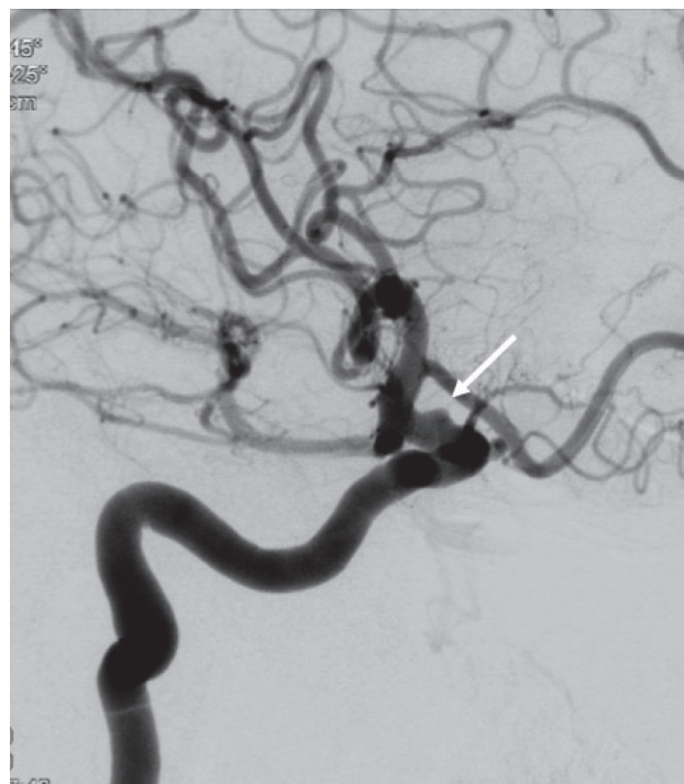
Figure 2. Digital subtraction angiography of the right carotid artery (oblique incidence) demonstrating a blood blister-like aneurysm (arrow).

The diagnosis is, sometimes, a clinical challenge. They are not easily detected at the first angiography due to their small dimensions and unusual site, but because of their rapid growth they appear more evident a few days later and tend to re-rupture (1,3,7-8) . Morphologically they appear as wide-necked shallow outpouchings of non-branching sites commonly of the supraclinoid ICA (8) (FIGURE 2). Usually, it is necessary intraoperative observation for the final diagnosis, because the angiographic evidence of a saccular shape did not always correlate with the nature of the aneurysm wall (3,9) . They often contain a fragile thin wall and a broad communication with the parent vessel, without an identifiable neck (8) . The evolution of the BBAs into a saccular-like aneurysm in subsequent angiogram is just an illusion, because this new aneurysm does not have the thick wall of a true berry aneurysm (1,10) . Any patient with SAH in an aneurysmal pattern and no detectable berry aneurysm should be carefully scrutinized for a blister aneurysm (8,11) . The CT Angiography diagnosed four of six patients prospectively and five of six retrospectively, therefore a normal Angio-CT does not exclude a BBAs aneurysm.