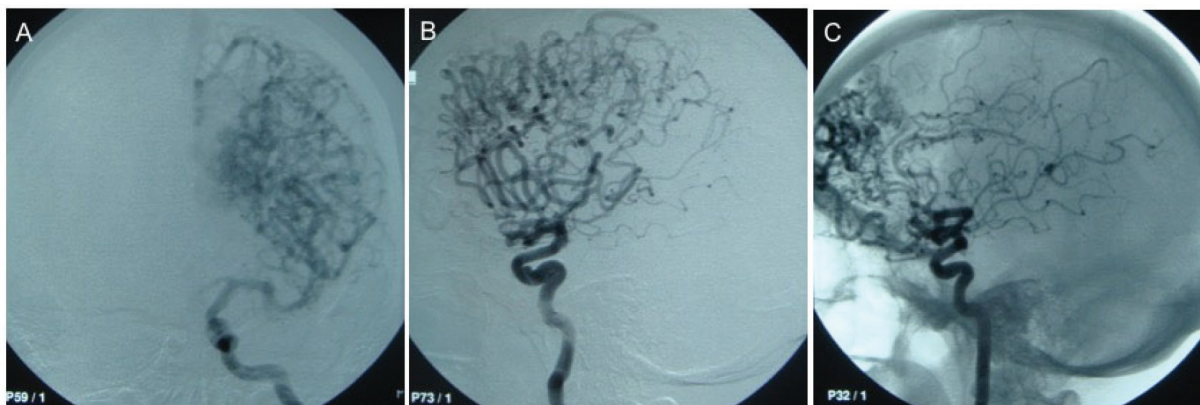
Figure 2: Cerebral angiography showing (A – left internal carotid artery / frontal view; B - left internal carotid artery / lateral view; C - right internal carotid artery / lateral view without subtraction) a diffuse network of vascular structures throughout the left frontal lobe, with multiple feeders, without a dominant one.

When hemorrhage is the target, partial embolization seems to be sufficient. Partial targeted embolization was employed and yielded progressive improvement in the case reported by Giragani et al, 2018, where the source of bleeding could be clearly identified (14) and also in a case series by Lasjaunias et al, 2008 (2) .