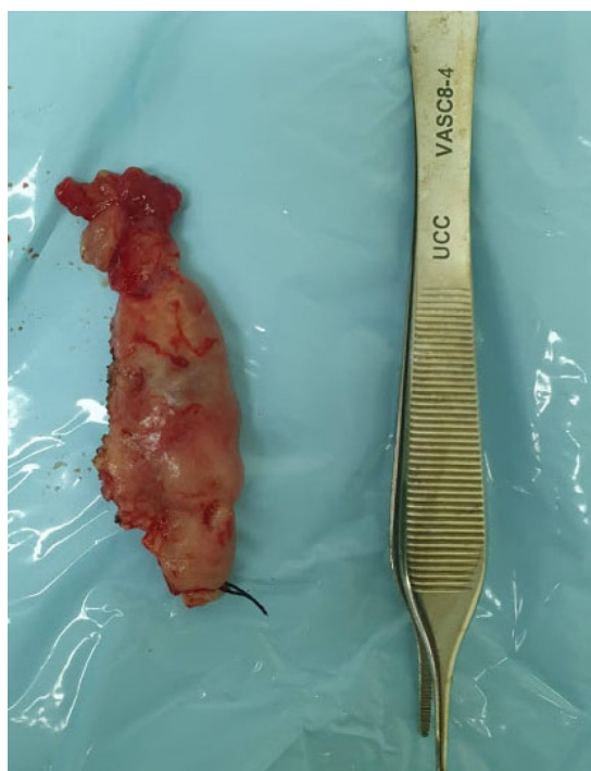
Figure 3 - Salpingectomy specimen

ted to be 1 in 30,000 in spontaneous pregnancies, but in pregnancies conceived using assisted reproductive techniques, it is reported to be as high as 1 in 100 (4) .